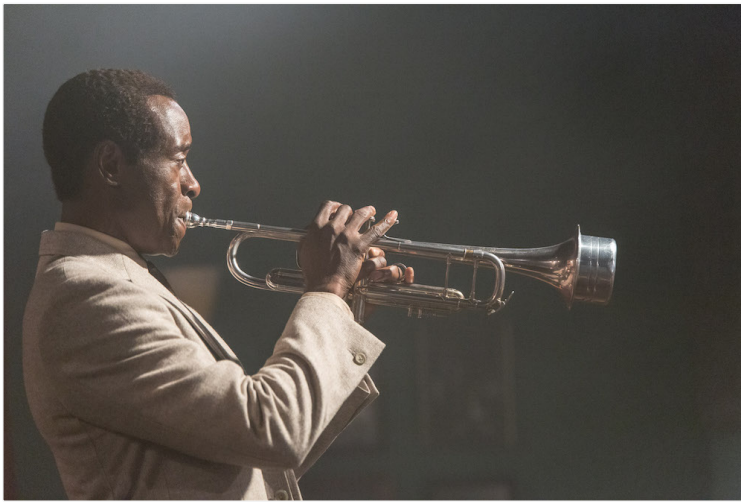
Don Cheadle as Miles Davis in the film Miles Ahead.