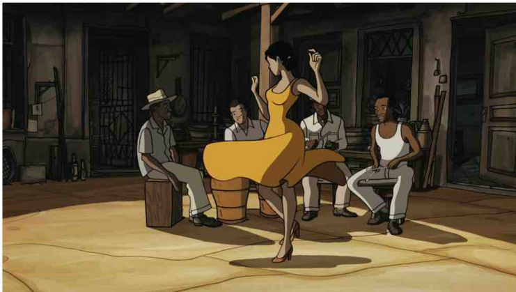
From the film Chico and Rita.